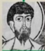
James the Great