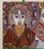
John the Evangelist

Apostle, Author of John, 1,2,3 John & Revelation