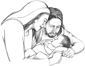
The Miracle of Christmas